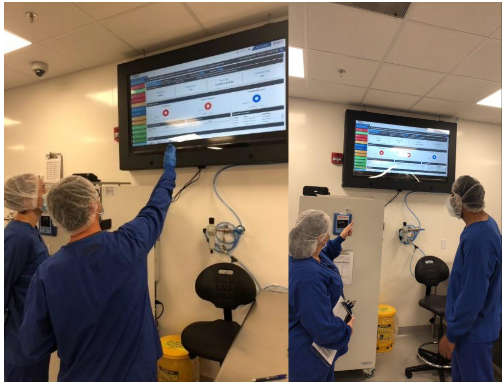
POMS net Falcon Dives into Pharma and Biotech GMP Facilities Across the Globe