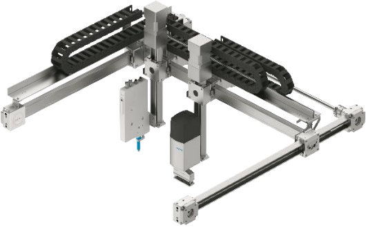
This configuration of the EXCL gantry accommodates two independent Z-axes. On the left: a pipette system aspirates and dispenses; on the right: the EHMD rotary gripper for decapping and gripping.